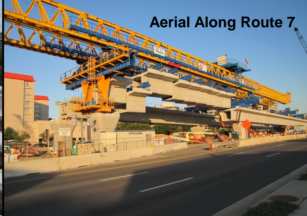
Aerial Along Route 7