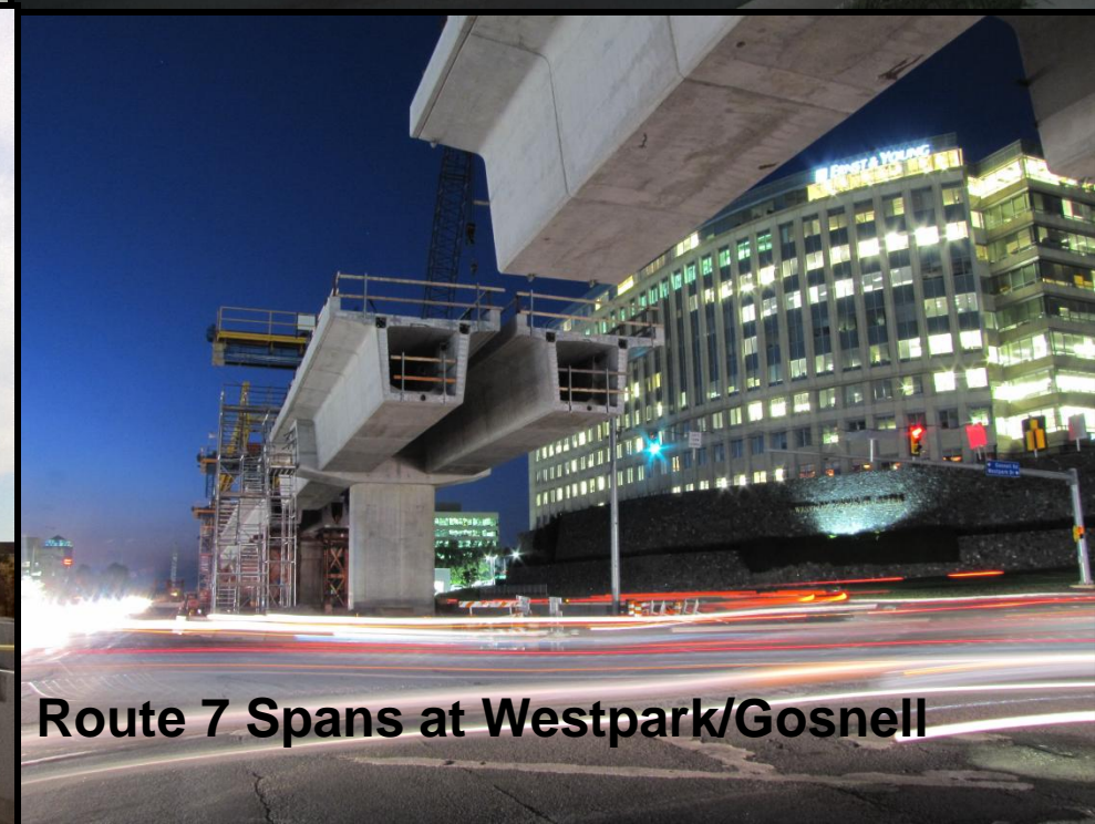
Route 7 Spans at Westpark/Gosnell