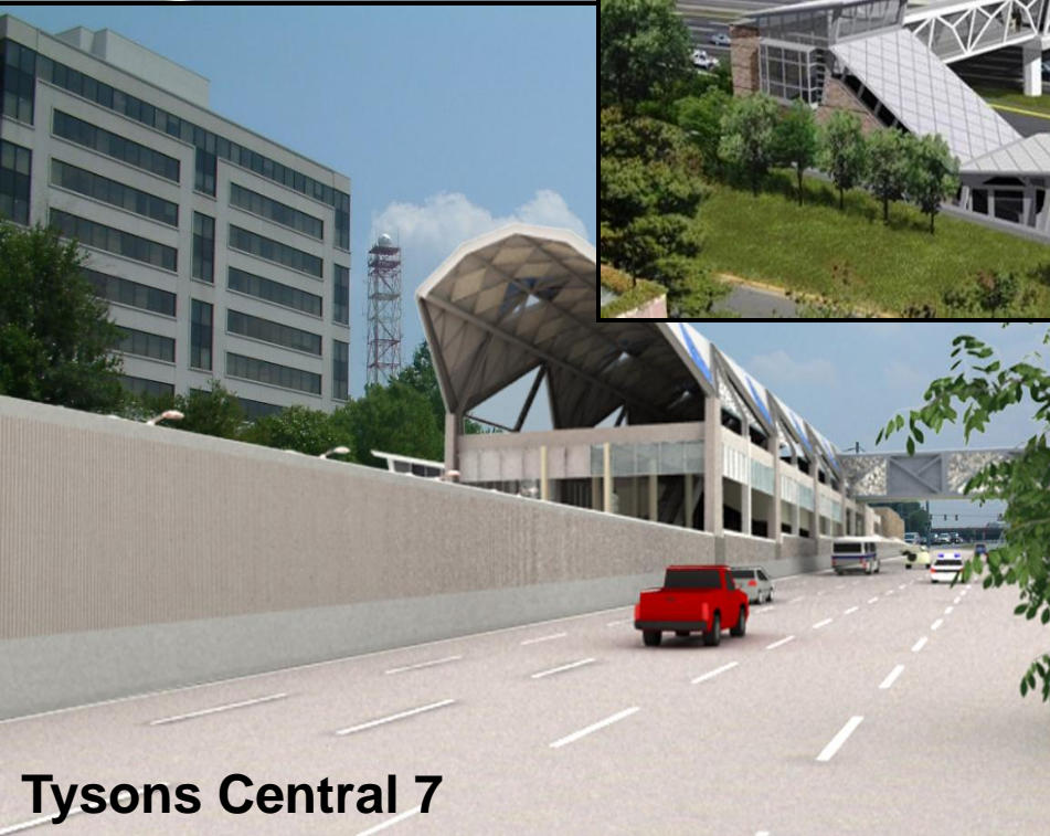
Tysons Central 7