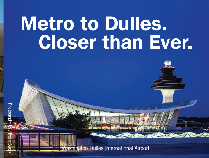
Washington Dulles International Airport