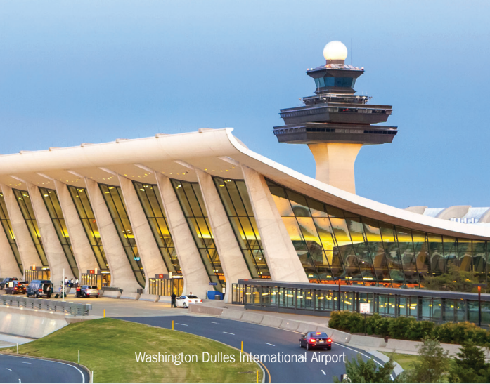
Washington Dulles International Airport

Connecting travelers between Washington Dulles International Airport and the Wiehle-Reston East Metrorail Station.