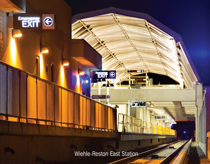
Wiehle-Reston East Station