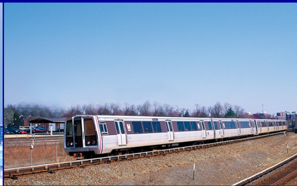
Dulles Corridor Metrorail Project