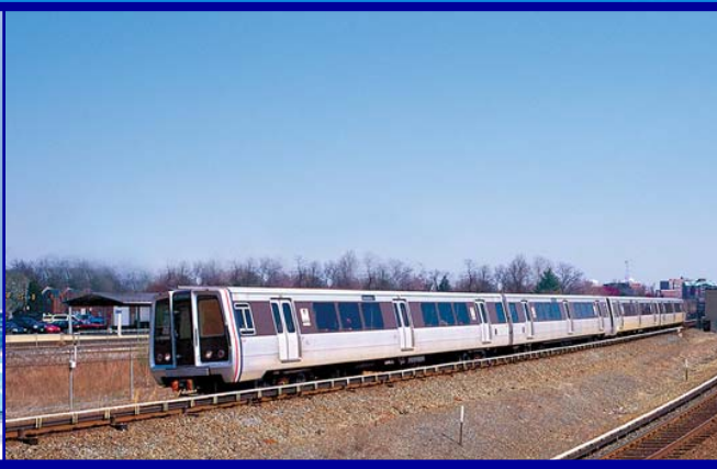
Dulles Corridor Metrorail Project