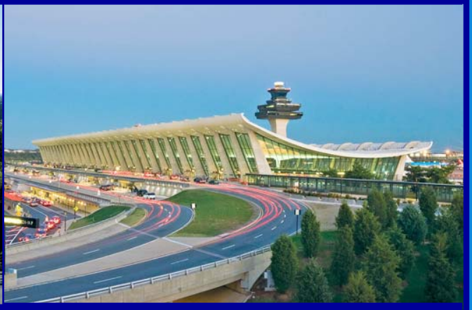
Washington Dulles International Airport