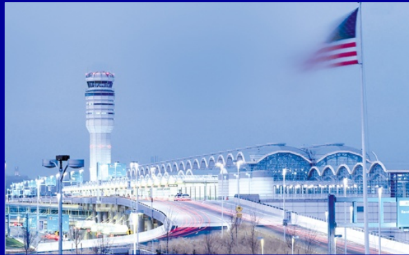
Ronald Reagan Washington National Airport