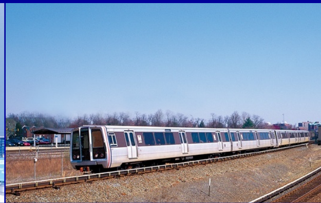
Dulles Corridor Metrorail Project