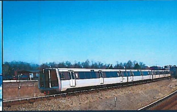
Dulles Corridor Metrorail Project