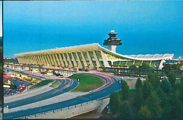
Washington Dulles International Airport