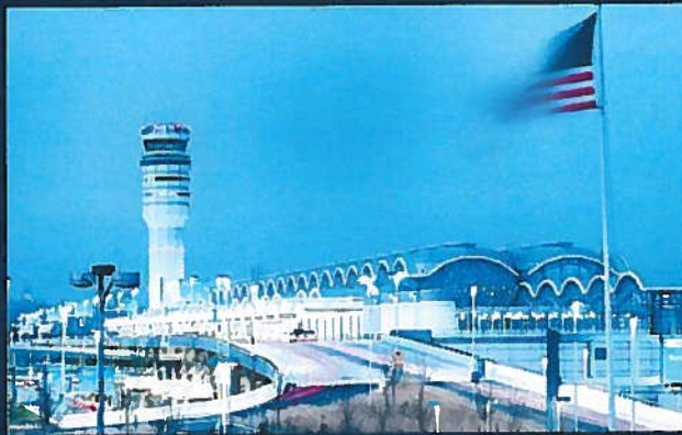
Ronald Reagan Washington National Airport