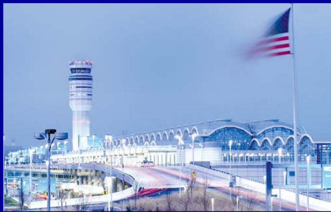
Ronald Reagan Washington National Airport