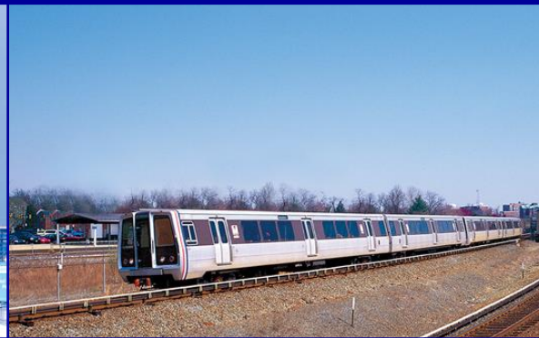
Dulles Corridor Metrorail Project