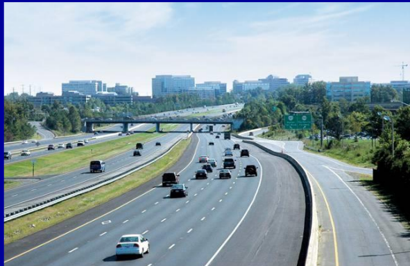
Dulles Toll Road