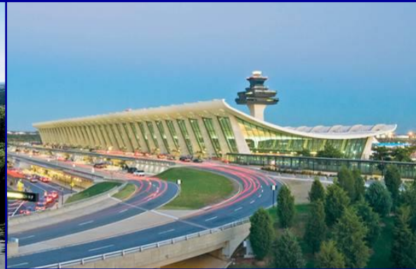
Washington Dulles International Airport