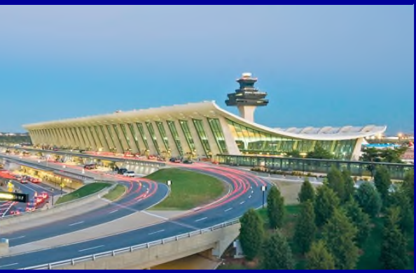
Washington Dulles International Airport