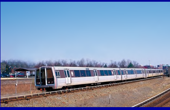
Dulles Corridor Metrorail Project