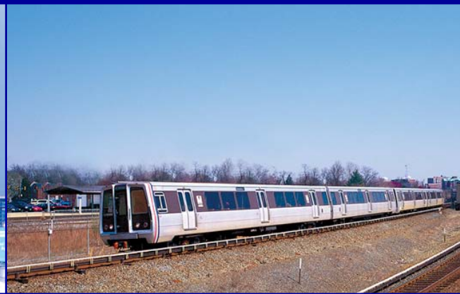
Dulles Corridor Metrorail Project