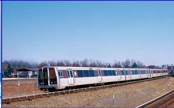
Dulles Corridor Metrorail Project