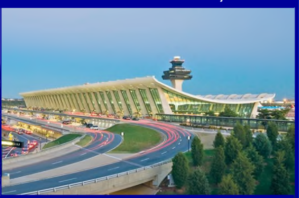
Washington Dulles International Airport