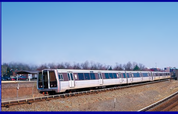
Dulles Corridor Metrorail Project