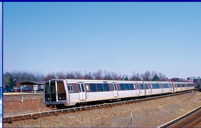
Dulles Corridor Metrorail Project