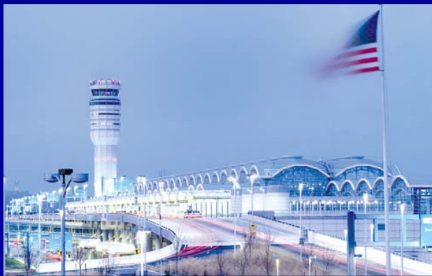
Ronald Reagan Washington National Airport