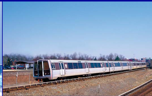
Dulles Corridor Metrorail Project