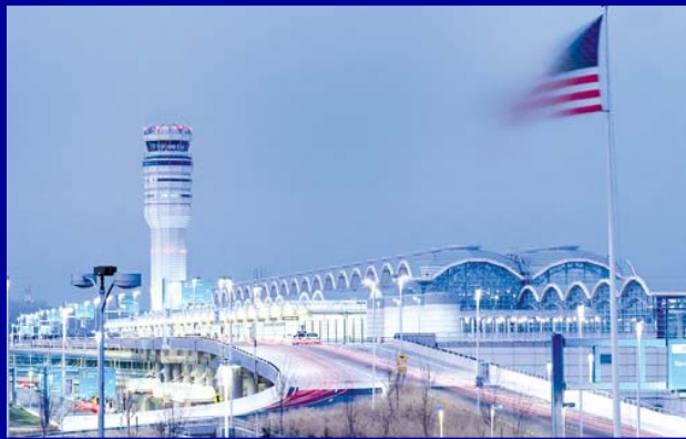
Ronald Reagan Washington National Airport