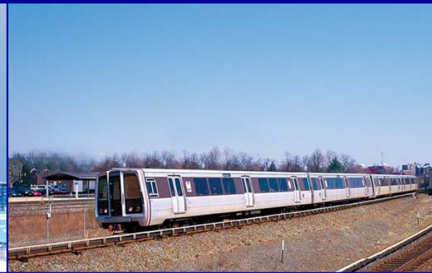
Dulles Corridor Metrorail Project