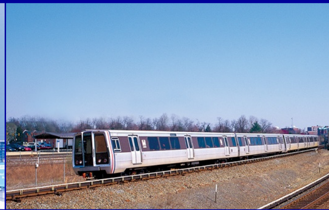
Dulles Corridor Metrorail Project