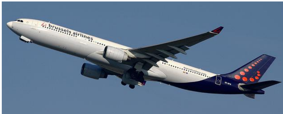
Brussels Airlines – Dulles/Brussels, Belgium (5x per week) – June 18