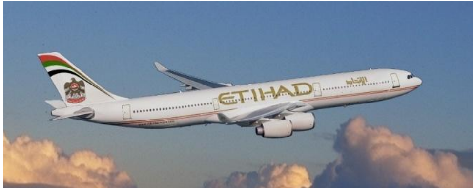
Etihad – Daily Dulles/Abu Dhabi, UAE – March 31