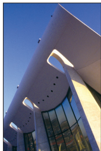
Washington Dulles International Airport

*Source: 2005 Economic Impact Study conducted for the Metropolitan Washington Airports Authority by Martin Associates.