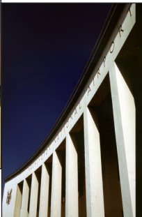
Ronald Reagan Washington National Airport