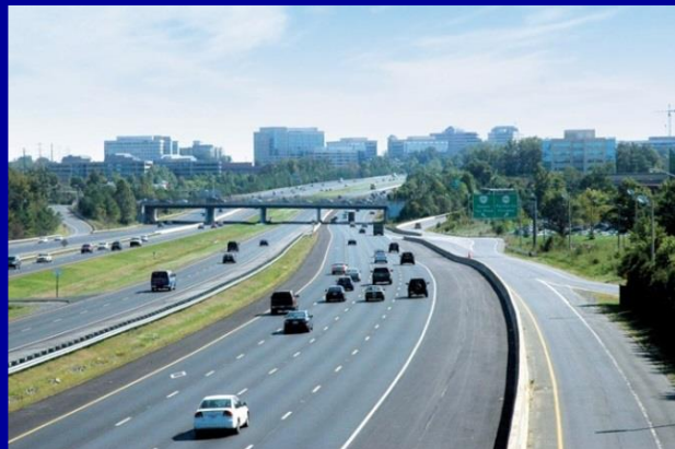
Dulles Toll Road