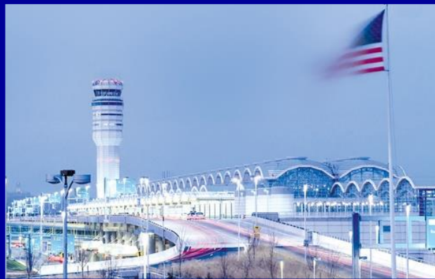
Ronald Reagan Washington National Airport