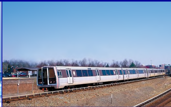
Dulles Corridor Metrorail Project