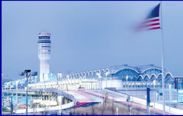
Ronald Reagan Washington National Airport