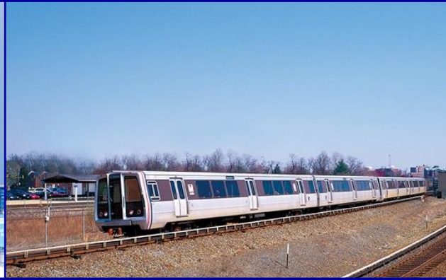
Dulles Corridor Metrorail Project