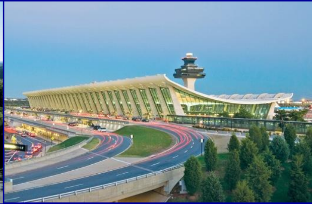
Washington Dulles International Airport