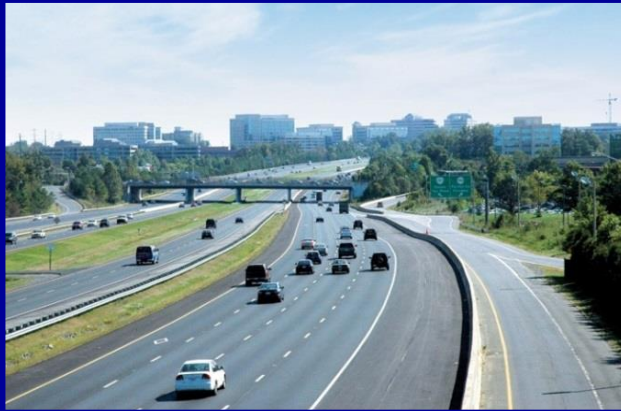
Dulles Toll Road