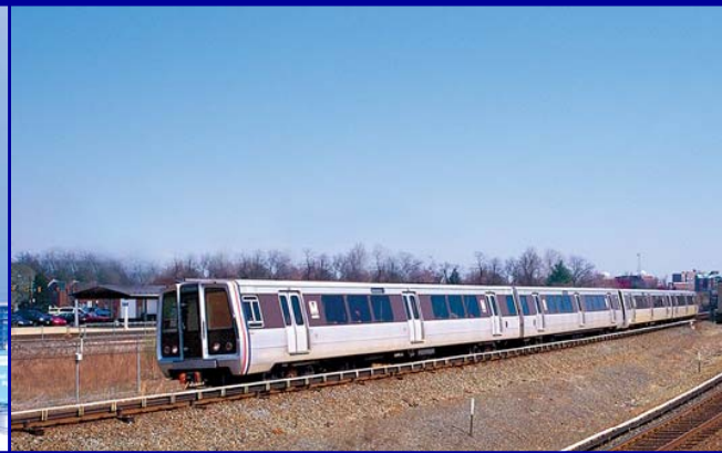
Dulles Corridor Metrorail Project