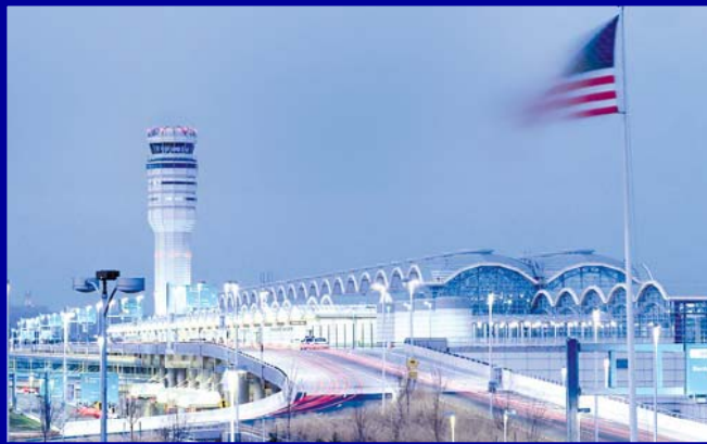
Ronald Reagan Washington National Airport