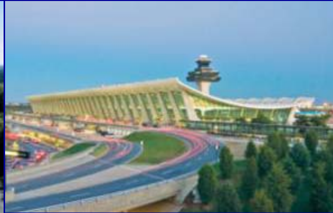
Washington Dulles International Airport