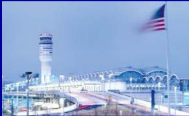
Ronald Reagan Washington National Airport