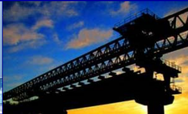
Dulles Corridor Metrorail Project