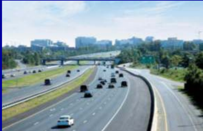
Dulles Toll Road