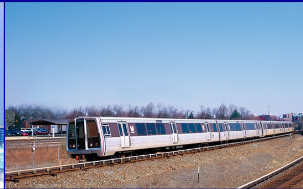
Dulles Corridor Metrorail Project