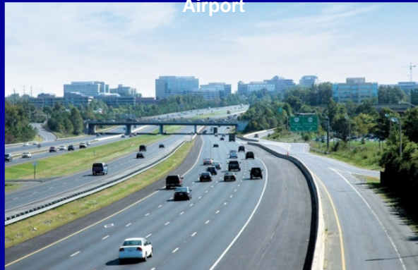
Dulles Toll Road