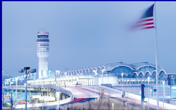
Ronald Reagan Washington National Airport