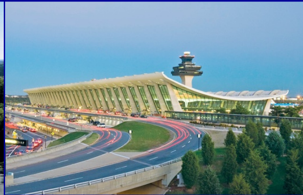
Washington Dulles International Airport