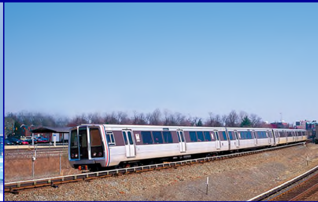
Dulles Corridor Metrorail Project