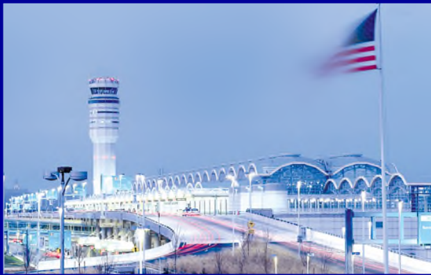
Ronald Reagan Washington National Airport