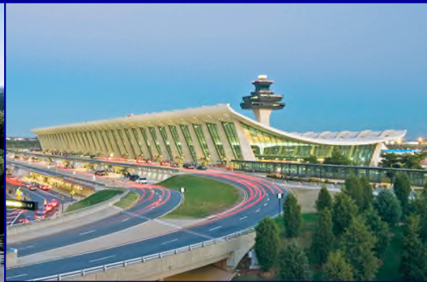
Washington Dulles International Airport