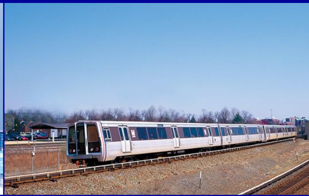
Dulles Corridor Metrorail Project