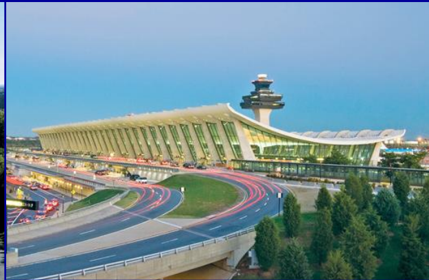
Washington Dulles International Airport